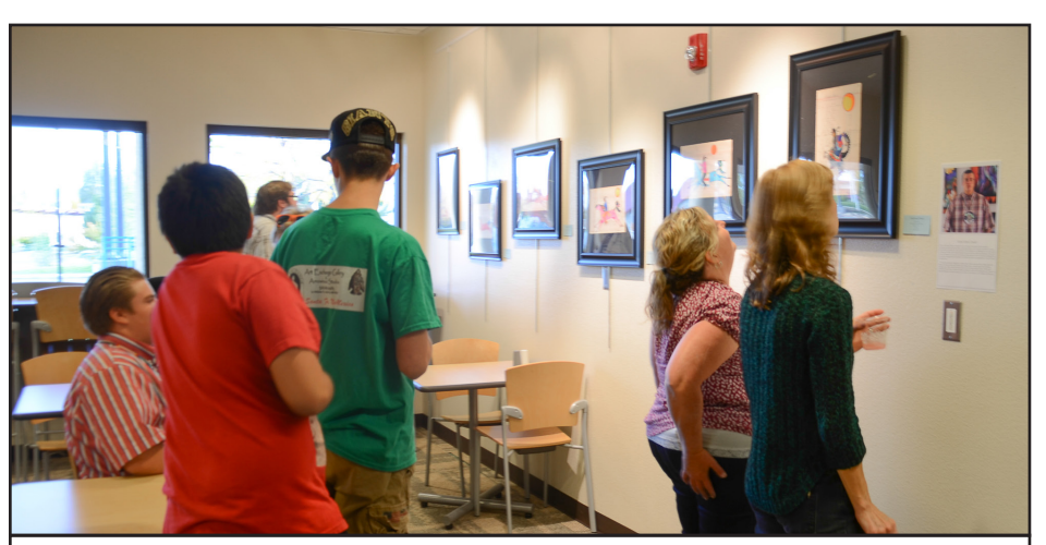
Guests of the Great Basin College Art Gallery's opening reception of "Trails to Remember: Native Artists Connecting the Past to the Present."

Elko, October 8 - Art lovers, family and friends of three showcased Native artists, from the Te-Moak tribe, turned out of the opening reception of "Trails to Remember: Native Artists Connecting the Past to the Present."