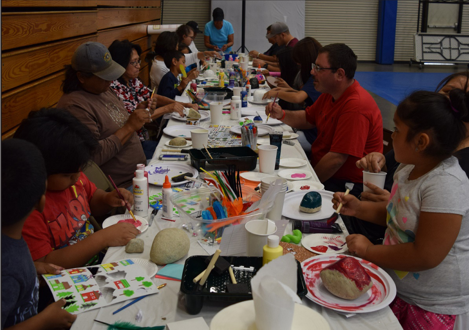
Young and old alike participated in the "Building Our Foundation" rock decoration competition with paints and other decorations. People expressed some aspect of their ideal sense of community.

The document showing the number of votes they received throughout the entire planning process are available now on our project Facebook page "Planning for Our Future" and at www.temoaktribe.com