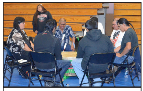
Painted Horse, Owyhee, Nevada

Nevada, were then asked for the flag song, then an honor song.